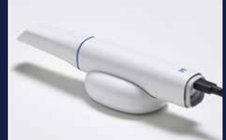
TouchBand™ & TouchPad